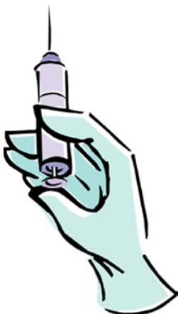
7 Some people wear _____ to protect themselves against _____