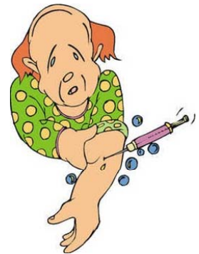
6 Drug _____ is a problem in our society.