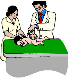
4 The baby is getting a _____ to give it _____.