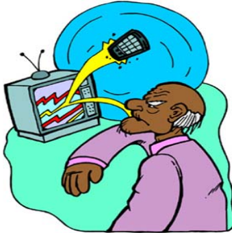
4 _____ _____