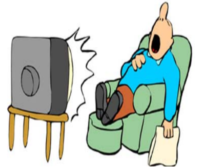
9 _____ _____

Use your own ideas & write supporting sentences about television below the pictures. Then write an opinion paragraph below. Make sure to start with a topic sentence clearly stating your opinion. For example, Television is beneficial in many ways. or I don't need a television in my house.