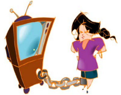
6 _____ _____