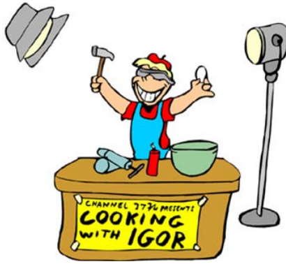
2 _____ _____