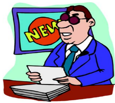
8 _____ _____