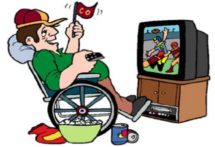
3 _____ _____