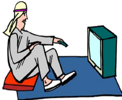
5 _____ _____