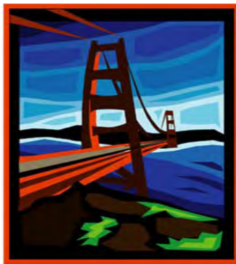
1. Engineers design/ build bridges.