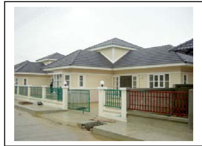
2. New suburban house